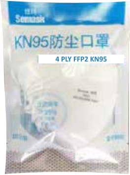
4 PLY FFP2 KN95